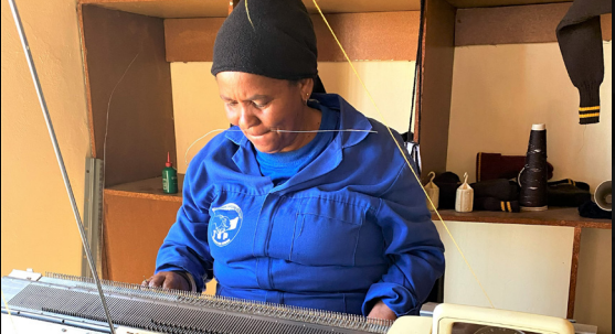
Tshwaraganang Barolong Project - Page 15