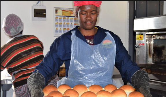
Glowing Sunrise Confectionery & Bakery Cooperative - Page 23