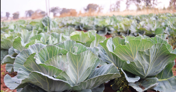
Dirang Batswana Greenery Project - Page 21